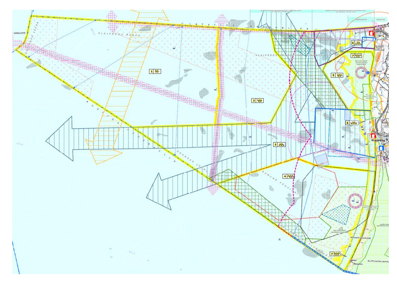
Scale: 1:200 000