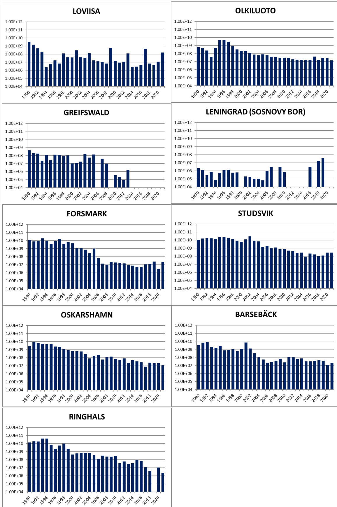
Fig. 1. Annual liquid discharges of caesium-137 from nuclear power plants and other nuclear facilities into the Baltic Sea in 1990-2021 (Note: logarithmic scales in the graphs)