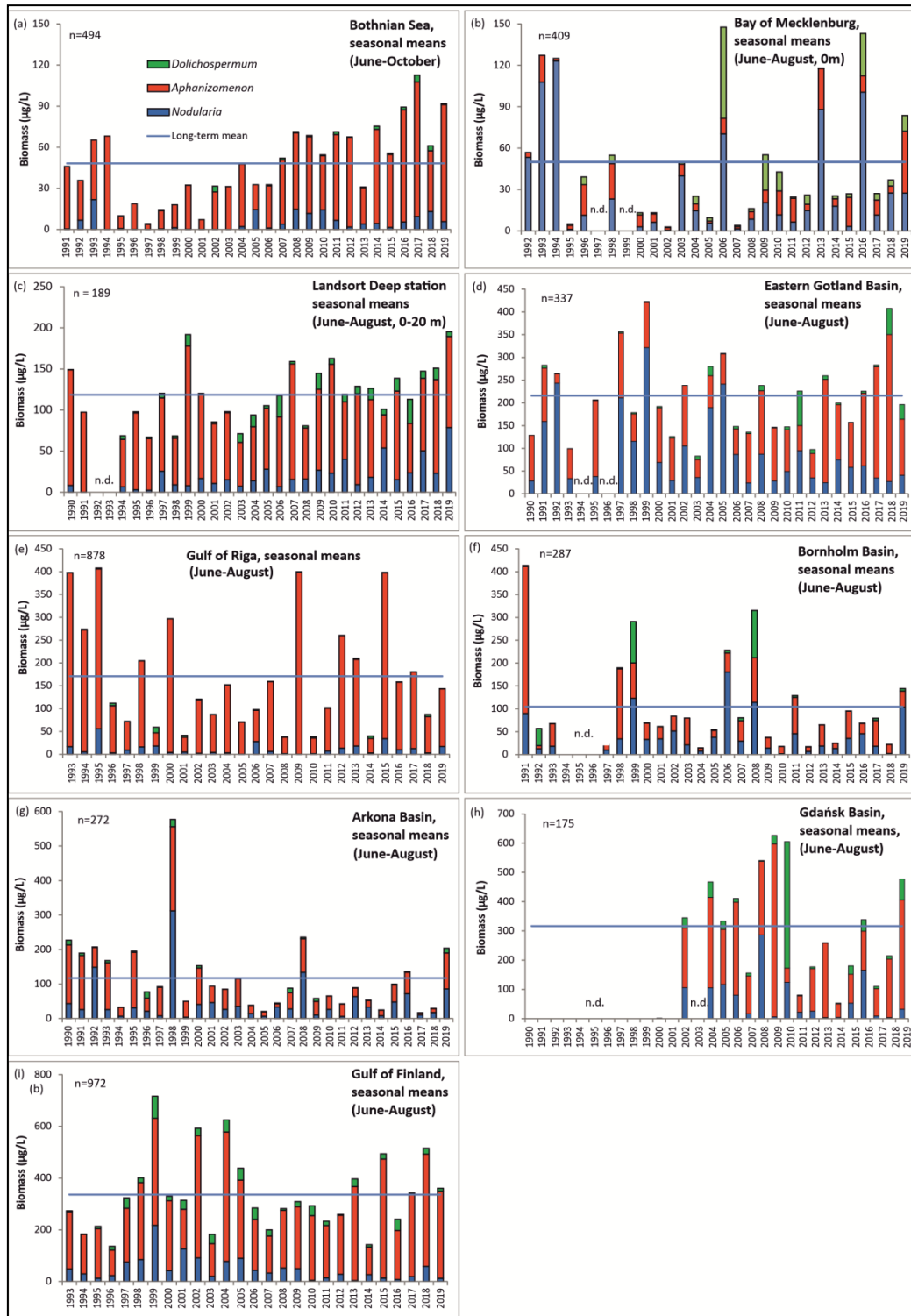
Fig. 2: Mean biomass (wet weight, \mu\text{g/L} ) of the three bloom-forming cyanobacteria genera in the different Baltic Sea areas (a-i) during their blooming period (note the different scales). The long-term mean per area (all species together) is indicated by a horizontal line. “n” is total number of samples analysed for this region, “n.d.” = no sufficient data.