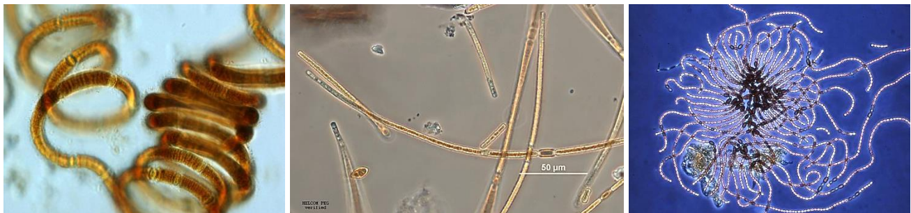
Fig. 3: Genera included in index, from the left: Nodularia , Aphanizomenon and Dolichospermum (previously Anabaena ).

2. Description of data: Biomass data (wet weight in \mu\text{g/L} ) in integrated samples (0-10 m; 0-20 m at the Landsort Deep; surface = 0-1 m in Bay of Mecklenburg; 0-5 m at the Polish high-frequency coastal station BMPL5). Sampling at the Finnish high-frequency coastal stations "Hailuodon ed int. asema", "Suomenl Huovari Kyvy-8A", "UUS-23 Längden" and "Vav-11 V-4" reached from surface to the depth of 2x Secchi depth (usually 0-8 m, maximum depth is 10 m); they could be integrated into the existing data series without problems. Genera included in index: Nodularia , Aphanizomenon and Dolichospermum (previously Anabaena ) (see Fig. 3).