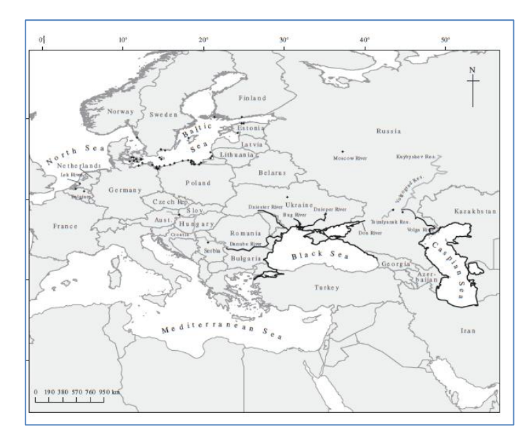
Figure 2: Distribution of Neogobius melanostomus (from Kornis et al. 2012)

<u>Assessment 2</u> (medium risk): Except when assisted by man, the species does not colonize remote places. Natural dispersal rarely exceeds more than 1km per year. The species can however become locally invasive because of a strong reproduction potential.