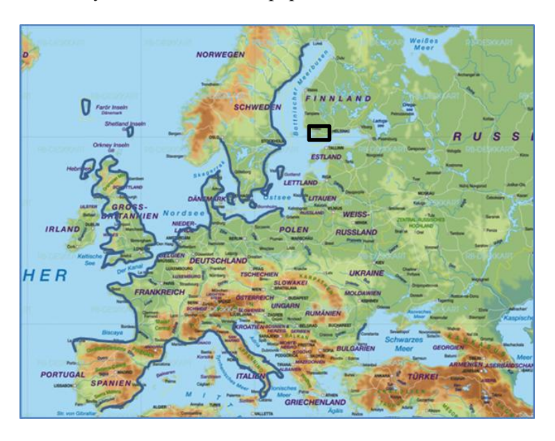
Figure 3: Distribution of Rhithropanopeus harrisii (blue lines at the coasts) (redrawn from Daisie 2012b), the black square marks the finding near Turku and Naantali

The current distribution of Rhithropanopeus harrisii is shown in Figure 3. It has a high fecundity, a long planktonic larval period a wide tolerance range of several environmental factors that likely facilitated its invasion success (Williams 1984 in Fowler et al. 2013). In Finland it spreads very fast: it was found in the port of Naantali near Turku for the first time in 2009 and only two years later (2010-2012) it was detected in an area around Naantali within a radius of 30 km at 82 locations (Fowler et al. 2013). In other regions it spreads not very fast, e.g. in Poland. There, it forms stable populations in the Vistula and Dead Vistula River, but no crabs were found in the Gulf of Gdansk, with which both reservoirs are connected (pers.comm. M.Normant). Therefore it seems that the species dispersion potential is very high, however, it only forms stable populations if the preferred habitat is available. Assessment 3 (high risk): The species is highly fecund, can easily disperse through active of passive means over distances > 1km/year and initiate new populations.