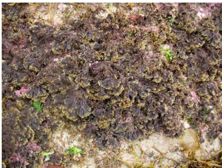
Stypocaulon scoparium .

There are no recent records of Stypocaulon scoparium in the Baltic Sea. There are several records from the eastern coast of Sweden (Bothnian Sea, Åland Sea, Northern Baltic Proper, Western and Eastern Gotland Sea) from the 1950s. Some of these localities have been revisited with no recoveries. There are also some older records from Finland (Gulf of Finland), Germany (Kiel Bay), Denmark (Kattegat, Great and Little Belt) and the Swedish west coast (Kattegat, The Sound).