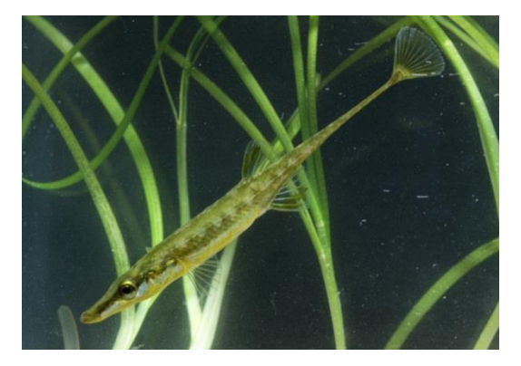
Fifteen-spined stickleback.

This marine species is widely distributed and reproducing as far into the Baltic Sea as the Bothnian Sea. It is considered very rare in Poland but common in other areas. It is not caught in regular coastal fish monitoring due to its slender body shape and small size. The only known trend data are from catches in Swedish nuclear power plant cooling water intake in Kattegat where the population show no overall trend in the last 10 years.