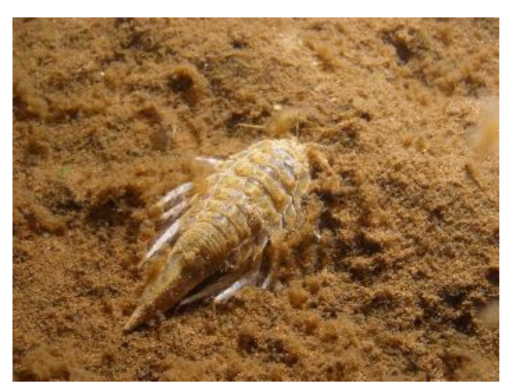
Saduria entomon.

Saduria entomon is distributed over the Baltic Sea, but not in the Belt Sea. In the western Baltic Sea (Arkona Basin, Bornholm Basin) its distribution is restricted to areas deeper than 10 m (needs cold water), whereas in the eastern and northern sea areas it is found also in the surface waters. In the northern part it is found from the shallow coastal areas to the deepest parts (depending on the oxygen conditions). In the southern parts it is found mostly in the deeper parts depending on the temperature regime. The loss of oxygen in the Baltic Sea bottoms has caused some declines in the population.