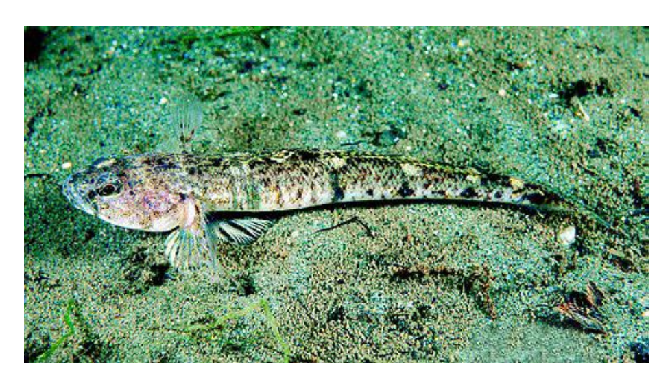
Norway goby.

The Norway goby occurs in coastal waters along the north-eastern coasts of Europe (Froese & Pauly 2012). It is very similar to the sand goby (Pomatoschistus minutus) but lives offshore on depths from 30 to 300 meters. The species has been overlooked and the first Swedish record originates from 1994. The Norwegian goby is presently considered common in the Skagerrak and rare in the northern Kattegat but virtually nothing is known about its occurrence within the HELCOM area.