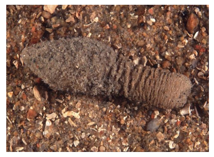
Pelonaia corrugata.

The main distribution of Pelonaia corrugata within the HELCOM area is in the Kattegat but the species has also been observed in the Sound. Most observations are from the Swedish part of the Kattegat, primarily from the shallow offshore banks. Outside the HELCOM area the species occurs in the Skagerrak and along the Norwegian coast. The habitat of the species - well oxygenated sand bottoms at 30–50 meters depth - are probably very rare in the HELCOM area.