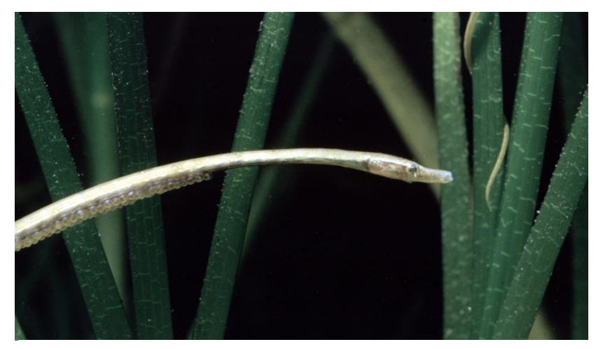
Pregnant male straight nosed pipefish.

The straight nosed pipefish is a marine species that inhabit algal zone or eel-grass beds (Zostera marina) along the coastal zone from 2 to 15 meters depth. Adults spawn in May to August. It feeds on small crustaceans and fish fry. The male broods the embryos attached to their abdomen where paternity is ensured despite brooding of embryos outside of the male's body. Each male broods eggs from a single female, for each brood, but females may deposit eggs on several males. (Dawson 1986, Froese & Pauly 2012, Kullander et al. 2012)