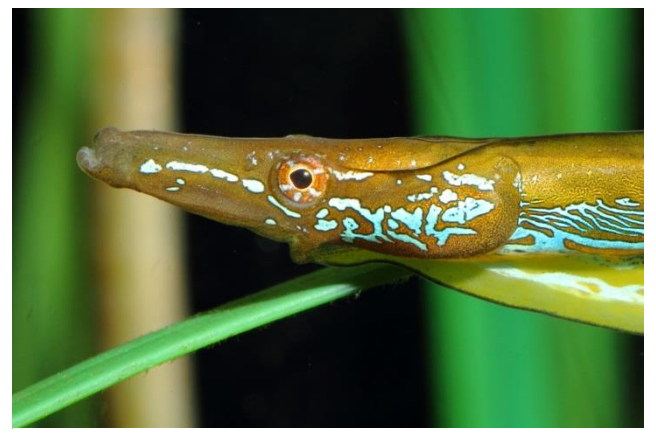
Straight nosed pipefish.

The straight nosed pipefish is commonly found along the west coast of Sweden and in the southern Baltic Sea, to a lesser extent in the Gulf of Bothnia. Elsewhere the distribution extends from central Norway south along the coast (including the British Isles) to Morocco and continues into the Mediterranean Sea and Black Sea. It is not distributed, however, along the North Sea coast between Denmark and the English Channel. Like most species of the Syngnathidae family, the distribution and abundance is not monitored well with standardized test fishing nets because of its snakelike body.