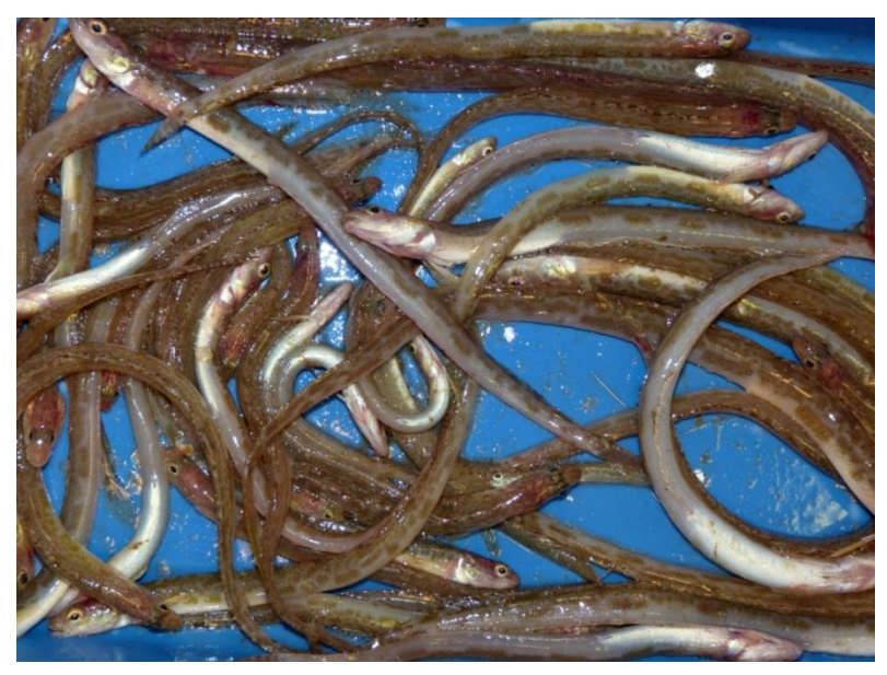
Catch of snake blenny at the International Bottom Trawl Survey 2012.

The snake blenny occurs on soft, muddy or sandy, bottoms from the Kattegat to the Gulf of Bothnia. It is mainly distributed on depths between 30 and 120 m. Reliable data on distribution, population size and population trend are lacking. The species is most likely negatively affected by the increase of areas with anoxic conditions in the Baltic Proper, and as a consequence decreasing area of distribution and habitat quality.