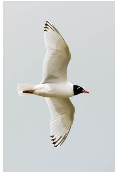
Larus melanocephalus .

The Mediterranean gull has a widespread, but patchy distribution in Europe. The range of the species is almost restricted to this continent, but it expands also to central Turkey. The total population is large (>120 000 bp) and increased during 1970–1990, in much of its range also during 1990–2000. The main breeding areas are the Mediterranean and the Black Sea (BirdLife International 2004). During the 20 th century, the species expanded its range. Since 1970, it is a regular breeder in The Netherlands and Belgium with increasing population numbers (Meininger & Flamant 1998). Around 2000, the western European population (France, Belgium, The Netherlands, Germany, and UK) counted already almost 5,000 bp (BirdLife International 2004). The colonization of the Baltic started in 1951, when the first breeding of a Mediterranean gull was recorded on the island Langenwerder, Mecklenburg-Western Pomerania.