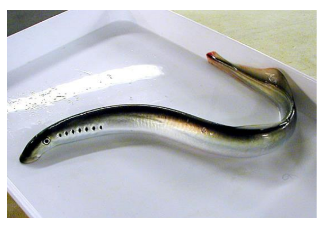
River lamprey.

The anadromous river lamprey is distributed throughout the HELCOM area including adjacent rivers and streams. A land-locked form is present in the greater lakes in Sweden and Finland. River lampreys are traditionally used as human food in the northern and eastern part of the Baltic Sea and there is a commercial fishery in Finland, Estonia, Latvia, Lithuania, Russia and Sweden. In Poland, spawning probably takes place in some Pomeranian rivers and lakes as well as in Odra and Vistula basins in connection with estuaries and coastal areas but there is lack of knowledge of this species. In Germany this species is considered critically endangered while there is a lack of knowledge of the status