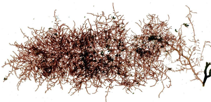
Helminthora divaricata on Polyides rotundus. Finavarra, Co Clare, Ireland; AlgaeBase

Helminthora divaricata is a marine species of red algae that is apparently rare in the HELCOM region. Its only records are from the northern Kattegat. There are two rather recent records from the 1990s and two old ones from the year 1894. In Sweden it has been found only from the Skagerrak and in Norway from the west coast.