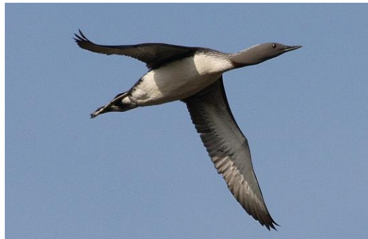
Gavia stellata .