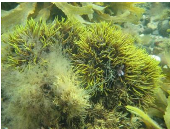
Furcellaria lumbricalis.