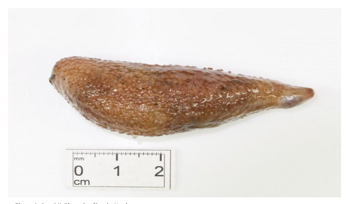
Ekmania barthii.

Ekmania barthii is a sea cucumber that has been found within the HELCOM area only in the western Baltic Sea. It is a rare species and there is not enough data to assess the status of the species in the Baltic Sea region. Elsewhere it is reported from Labrador and from eastern and western Greenland, Iceland, Svalbard, the Faroe Island, the Shetland Islands, and northern Norway (Hansson 2002).