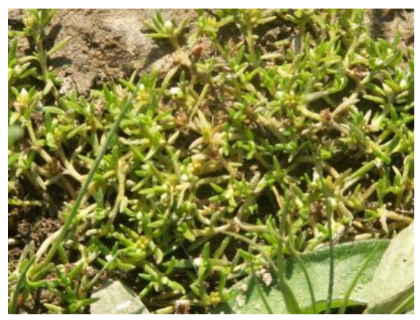
Crassula aquatica.

This species occurs scattered over Eurasia and North America. According to the Atlas Florae Europaeae (Jalas et al. 1999), the European distribution area of Crassula aquatica is clearly concentrated in Finland, Sweden and Russia. Within the Baltic Sea region the species occurs frequently in coastal waters. In Finland Crassula aquatica occurs in most of the country (Ryttäri et al. 2012), both in slightly brackish and freshwaters. In Sweden the species can be found along the western coast, Lake Vänern, River Dalälven and on the coast of Norrland in northern Sweden (Swedish Species Information Center 2010).