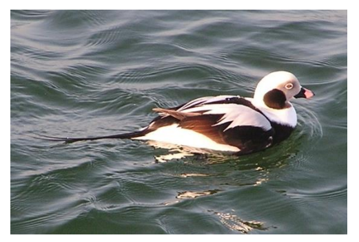
Clangula hyemalis.