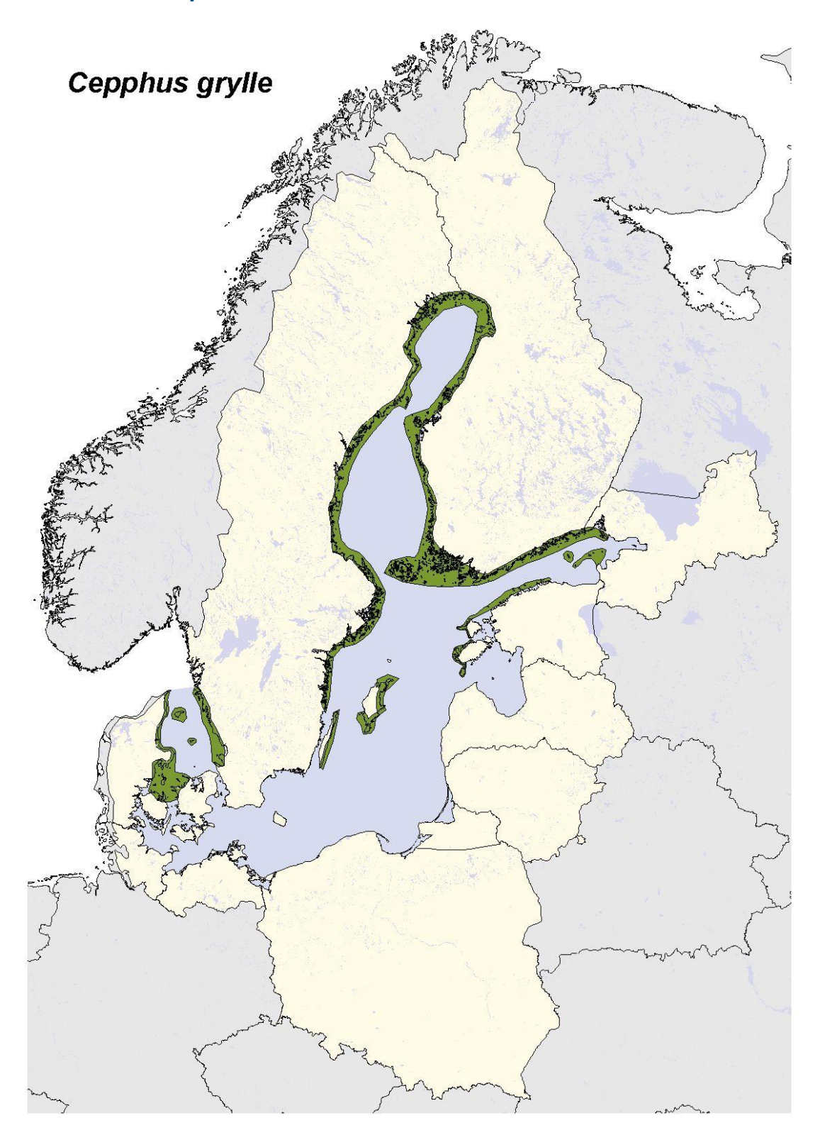
Map 2: Breeding distribution of black guillemots in the Baltic Sea area.