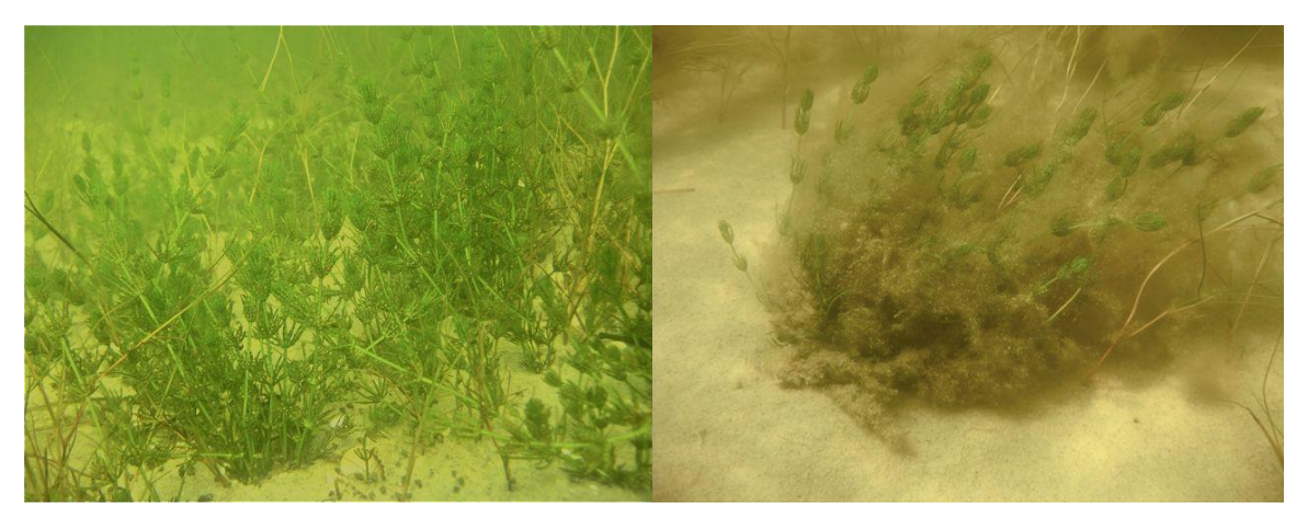
Charophytes (mainly Chara baltica ) mixed with some higher plants on sandy bottom (left), Chara baltica overgrown by epiphytes(rightl

Several other charophyte species may accompany those species: Lamprothamnion papulosum (in higher salinities only), Chara braunii, Chara connivens, etc, but seldom reach higher densities. Also higher plants like Zostera spp., Ruppia spp., Zannichellia palustris and Stukenia (formerly Potamogeton ) pectinata may occur in the biotope (Berg et al. 2004).