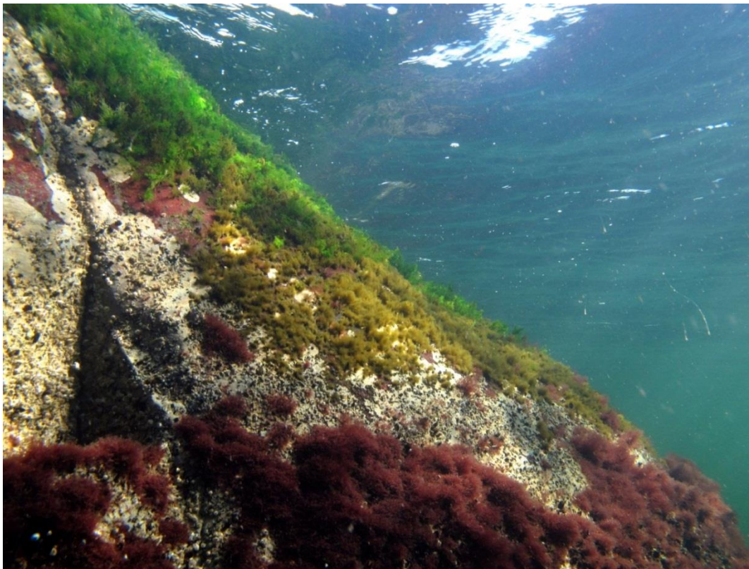
Algal belts are a typical feature of the underwater environment on boreal Baltic islets and small islands

The biotope complex is made up of groups of small skerries and islets that generally consist of bedrock or moraine. The biotope complex forms in shallow outer archipelago areas. The terrestrial vegetation is adapted to windy conditions and lack of soil cover, trees generally do not grow and any trees are low growing. The underwater macrophyte vegetation is characterized by attached macroalgae that generally form distinct belts, the green algae grow closest to the surface followed by a belt of brown algae and the deepest belt consists of red algae. Islets and skerries are very important nesting sites for birds and resting sites for seals.