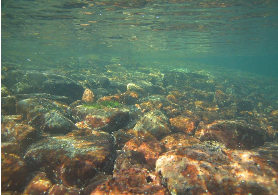
Underwater pebble bottom at an esker island

Animals: Insects- Athetis lepigone , Simyra albovenosa , Actebia praecox Molluscs- Cerastoderma glaucum , Mya arenaria