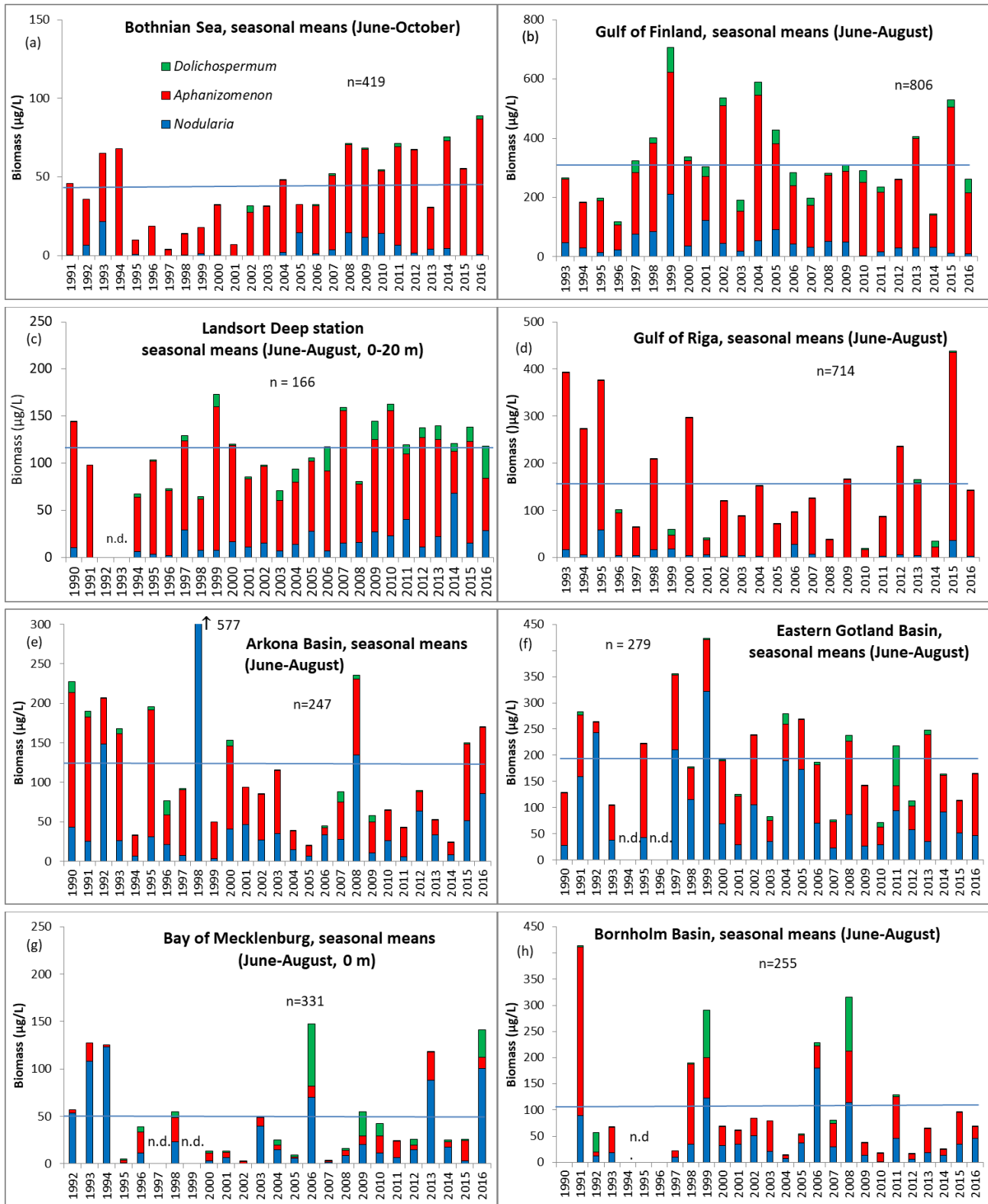
Fig. 2: Mean biomass (wet weight, \mu\text{g/L} ) of the three bloom-forming cyanobacteria genera in the different Baltic Sea areas (a-h) during their blooming period (note the different scales). The long-term average per area (all species together) is indicated by a horizontal line. "n" is total number of samples analysed for this region, "n.d." = no sufficient data.