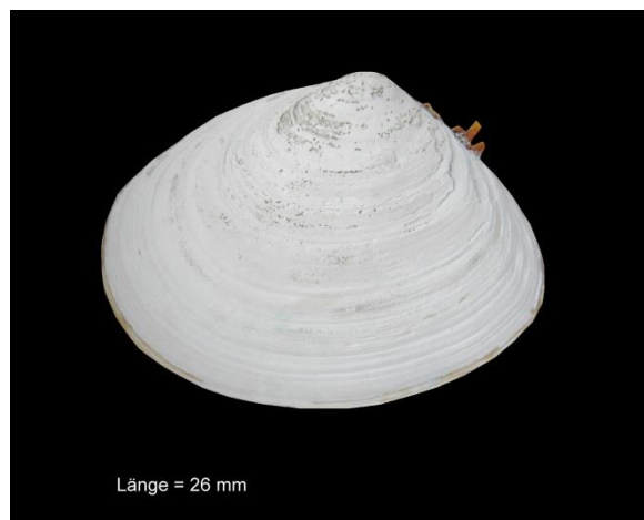
Macoma calcarea.

Macoma calcarea is currently restricted to the western parts of the HELCOM area. The species has occurred also in the Bornholm Basin and the Eastern Gotland Basin but due to oxygen depletion it has disappeared or severely declined in the eastern part of its former range. More generally, this is a northern Atlantic arctic species. In Europe there are records from Iceland and Norway and in the western Atlantic south to New York.