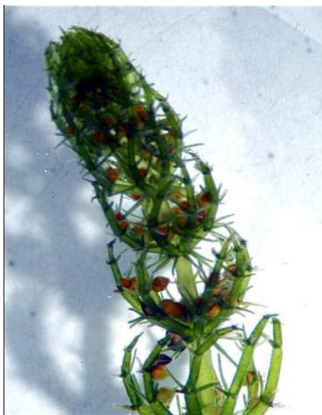
Lamprothamnium papulosum .

All recent and former records of the species are restricted to Denmark, Germany and the west coast of Sweden. In Sweden, there are some rather recent records along the west coast but mostly the newest