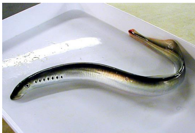
River lamprey.

The anadromous river lamprey is distributed throughout the HELCOM area including adjacent rivers and streams. A land-locked form is present in the greater lakes in Sweden and Finland. River lampreys are traditionally used as human food in the northern and eastern part of the Baltic Sea and there is a commercial fishery in Finland, Estonia, Latvia, Lithuania, Russia and Sweden. In Poland, spawning probably takes place in some Pomeranian rivers and lakes as well as in Odra and Vistula basins in connection with estuaries and coastal areas but there is lack of knowledge of this species. In Germany this species is considered critically endangered while there is a lack of knowledge of the status in Denmark. After a severe reduction of the species in the mid-1900s, due to establishment of hydropower plants, most Baltic areas show a stable development of the species in the last decades. Data from commercial landings in southern Baltic Sea show that despite a large decrease seen during the 1900s there is no decrease during the last 20 years. Furthermore Swedish electrofishing data from rivers show stable occurrence over the last 25 years. In contrast, the catches in Finland have been