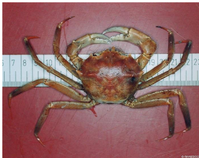
Geryon trispinosus .

Up until the 1960's the species was often reported as bycatch from trawling. During later decades it seems to have become quite rare although still sporadically reported as bycatch (information from Swedish fisheries, SLU Aqua). It seems to have declined in the Swedish part of the Skagerrak, e.g. Koster and Gullmaren fjords, but little information is available from the Kattegat.