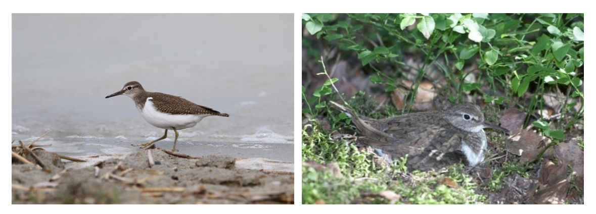
Actitis hypoleucos.

The common sandpiper is a widespread breeding bird across much of Europe. The European breeding population counts >720 000 bp. Although the population has been stable in much of its range, it has suffered significant declines in some of the key areas, especially Sweden and Finland.